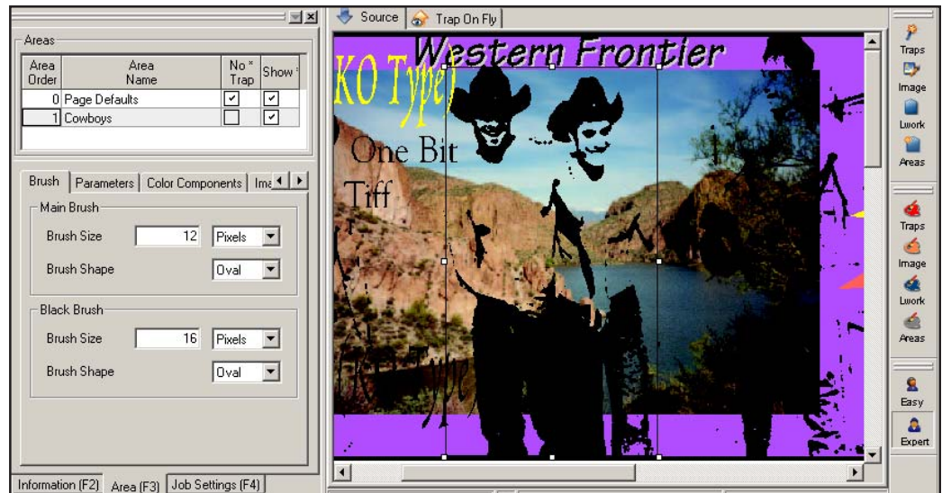
Selected area in the display source Window